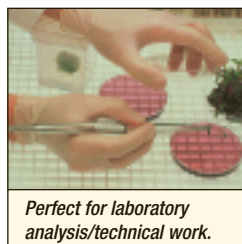
Perfect for laboratory analysis/technical work.