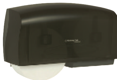
B For coreless rolls.

Now with built-in Microban® antimicrobial protection. Holds two 9.38" dia. x 3.8" wide jumbo rolls—more than the equivalent length of 12 standard rolls. Sliding door prevents using one roll until other is depleted. No keys or moving parts. High-impact transparent plastic construction. For use with SCOTT® Coreless JRT® Jr. Jumbo Roll Tissue KCC 07006. Smoke/Gray. 20w x 6d x 11h.