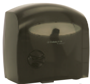
A For coreless rolls.

The first electronic bath tissue dispenser!