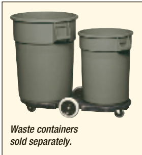
Waste containers sold separately.