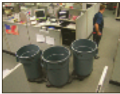
Move up to three containers at a time!