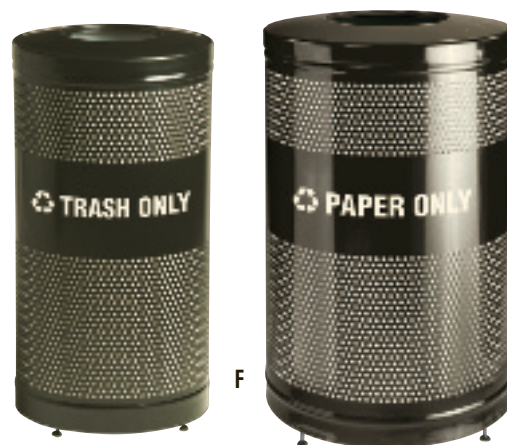
Product shown with optional decals sold separately on page 298.