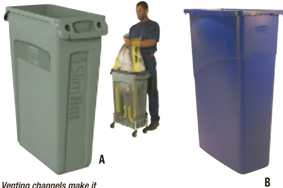
Venting channels make it easier to lift full can liners from the container.