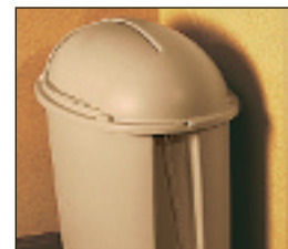
Slim, oval shape fits under counters and out of the way.