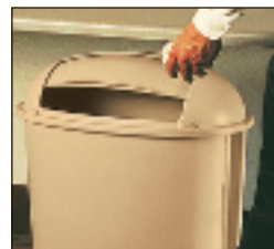
Roll top lid opens easily without the need for overhead clearance.